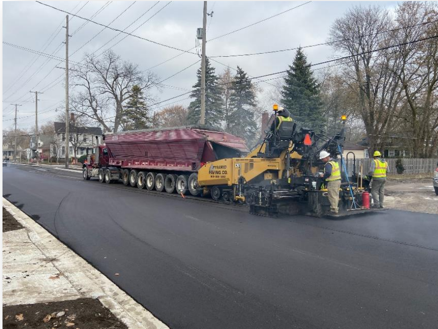
Trumbull Street Paving

The City of Bay City, utilizing BCATS funding, reconstructed Trumbull Street, from Center Avenue to Woodside Avenue. The work included new storm sewer, water main, sidewalks, and full reconstruction of the roadway that included widening the road from two lanes to three with a center turn lane. Work began in November of 2018 with tree and sidewalk removal. Over the winter, utility companies relocated facilities ahead of the major construction, which began April 15, 2019. The street was opened December 5, 2019. However there are a few more items to be completed in 2020. Tri-City Groundbreakers was the prime contractor with the low bid of $2,689,707, including $1,024,988 in federal funding and $1,664,719 in local funds.