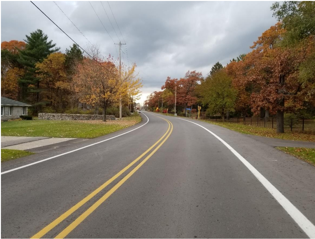
After Construction (Looking Northwest)