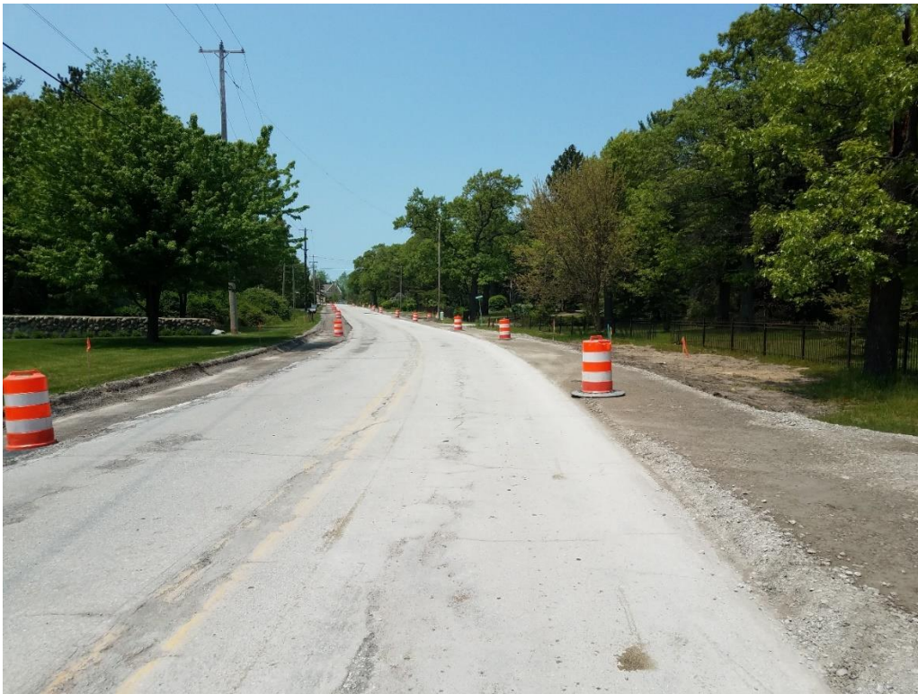
Before Construction (Looking Northwest)

Old Kawkawlin Road/Grove Street received a much, needed upgrade during the 2019 construction season. This project included rehabilitation from Grove Street's intersection with M-13 (Huron Road) in Kawkawlin to Two Mile Road approximately 0.80 miles to the southeast. The project is located in Monitor and Bangor Townships. The scope of the project included intersection upgrades at M-13 and Two Mile Road, new asphalt pavement with three-foot paved shoulders, drainage and safety improvements, new signing and pavement markings. Carrying approximately 3,000 vehicles per day, this roadway provides an alternate route for commuters and through traffic, relieving some of the traffic congestion on Wilder Road as Old Kawkawlin extends between State Park Drive and Kawkawlin. It also provides the detour route for either road construction or an emergency situation (accident, fire, etc.) that is taking place on M-13 (Huron Road). BCATS provided $630,000 in funding for this project with the Bay County Road Commission contributing a local match of $140,000 for a total construction cost of $770,000. The project was completed on time and under budget.